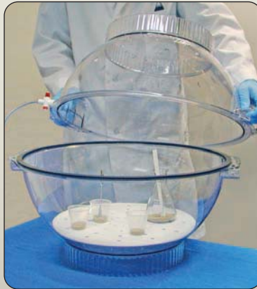
Techni-Dome® 360° Desiccators Generous Interior Volume with Unobstructed Views, Page 104