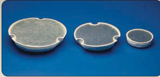
Desiccant in a Cartridge "No Fuss" Convenience, Page 107