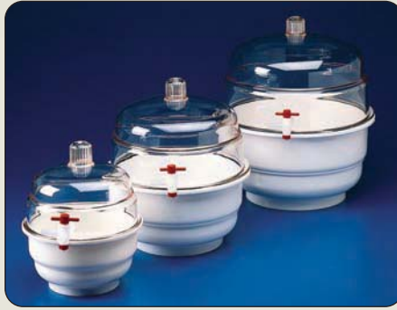
"Space-Saver" Vacuum Desiccators Maximum Interior Space, Page 105